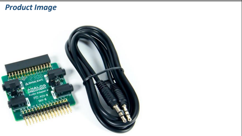
Image Links: https://flic.kr/p/2oyhj4j / (Oblique) https://flic.kr/p/2oyf3Lh / (Back)

Features Provides audio connectivity via 3.5 mm jacks for both Scope and Wavegen Inputs and outputs can independently use 2 mono jacks or 1 stereo jack, selected via jumpers Active circuitry powered by the Analog Discovery 3 power supplies Pass-through connector for all other Analog Discovery 3 signals, including Digital I/O, Triggers, and Power Supplies Compatible with the Analog Discovery 3