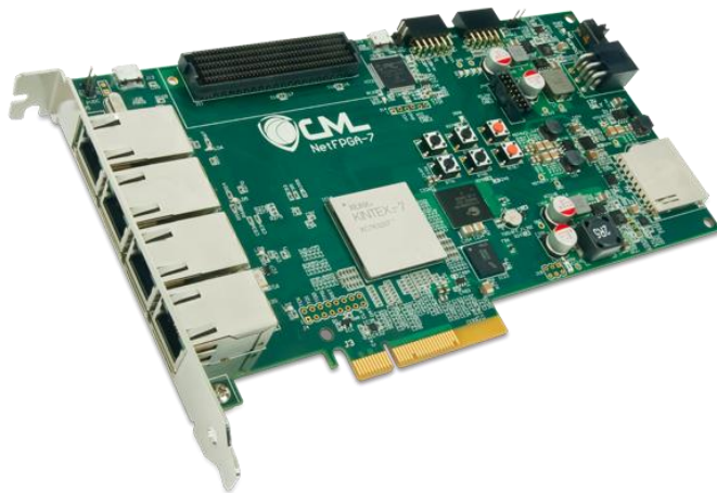
The NetFPGA-1G-CML board.

The NetFPGA-1G-CML is a versatile, low-cost network hardware development platform featuring a Xilinx® Kintex®-7 XC7K325T FPGA and includes four Ethernet interfaces capable of negotiating up to 1 GB/s connections. 512 MB of 800 MHz DDR3 can support high-throughput packet buffering while 4.5 MB of QDRII+ can maintain low-latency access to high demand data, like routing tables. Rapid boot configuration is supported by a 128 MB BPI Flash, which is also available for non-volatile storage applications. The standard PCIe form factor supports high speed x4 Gen 2 interfacing. The FMC carrier connector provides a convenient expansion interface for extending card functionality via Select I/O and GTX serial interfaces. The FMC connector can support SATA-II data rates for network storage applications. The FMC connector can also be used to extend functionality via a wide variety of other cards designed for communication, measurement, and control.