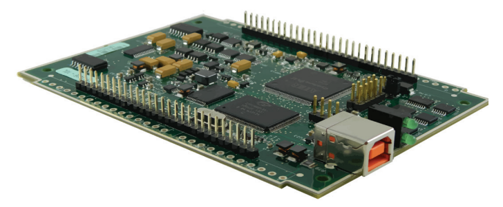
The OEM versions have the same specifications as the standard devices, but come in a board-only form factor with header connectors instead of screw terminals.

OEM versions have board-only form factors with header connectors for OEM and embedded applications (no case, CD, or USB cable included). All devices can be further customized to meet customer needs.