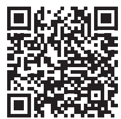
The QR code above links to the product page on the website

USA 18440 Technology Drive, Morgan Hill, CA 95037, USA t: +1 (408) 782-7773 EUROPE The Lake House, Knebworth Park, Herts, SG3 6PY, UK t: +44 (0) 20-7631-2150 ASIA 2/F Bamboos Centre, 52 Hung To Rd, Kwun Tong, Hong Kong t: (852) 2861-3615