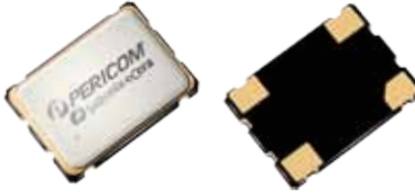
7.0 x 5.0mm Ceramic SMD