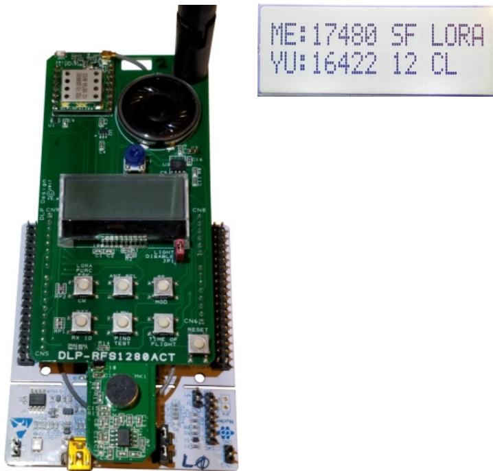
DLP-RFS1280ACT DEMONSTRATION PLATFORM (Serving as a Target for this demonstration)

The system is set up and ready for this demonstration once all Target transceivers are powered and set to LORA Mode. If a Target is set to GFSK or FLRC Mode, simply press Button 1 until “LORA” is shown in the display: