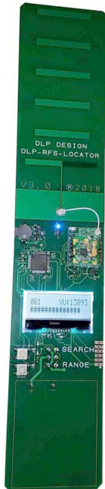
DLP-RFS-LOCATOR - Master Version 3.0

In this demonstration system, there is a single Master transceiver and up to 50 Targets. The hardware for the Master is hand-held and battery powered.