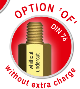
(Illustration: Brass blank, optional bl.)

Minimum tensile strength: 430 N/mm 2 Tolerance for length dimensions: +/- 0,1 mm