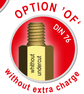
(Illustration: Brass blank, optional bl.)

Minimum tensile strength: 430 N/mm 2 Tolerance for length dimensions: +/- 0,1 mm