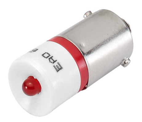
Attention: The preview is based on a sample product. This can differ from your current configuration.