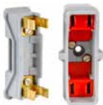
Red spot fuseholder - white