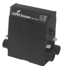
House service fuse holder black