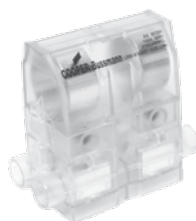
House service fuse holder clear