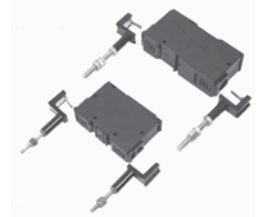
CAMaster accessories - Studs