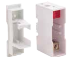
Safeclip fuseholder - white