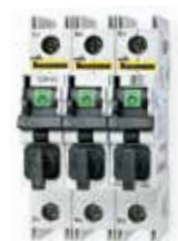
CCP - compact circuit protector