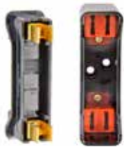
Red spot fuseholder - black