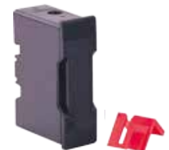
Safeclip fuseholder - black