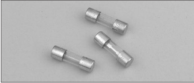
Dimensions - in