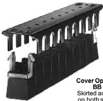
Cover Options BB Skirted access on both sides.