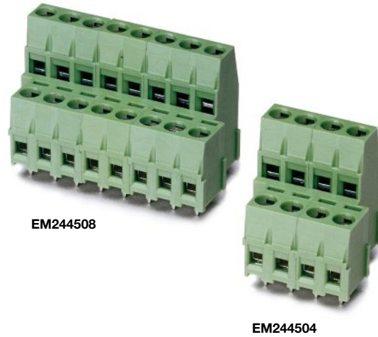
Dimensions - in (mm)