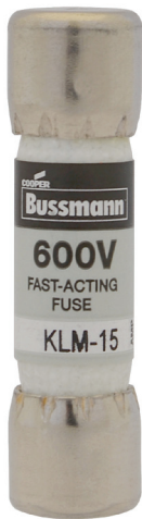
600Vac/dc 1 to 30A