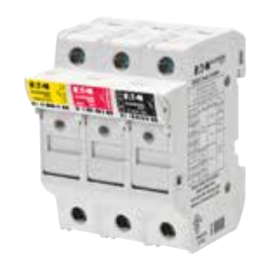
CH modular fuse holder for 10x38 mm fuses - PV (yellow), IEC 10x38 and UL midget (red), and UL Class CC (black)