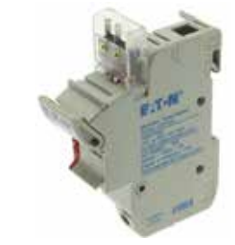
CH modular fuse holder with microswitch for 14x51 mm fuse