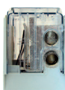
Optional 400A Class J Version (JM60400- MW22)

††For Class J 400A double box lug configuration, optional cover provides IP20 finger-safe protection for dual 350kcmil-1 AWG wires or one single 350kcmil-6 AWG wire.