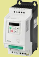
PowerXL™ DA1 Advanced Machinery Drive

The DS7 soft starter is ideal for applications like pumps, fans, and small conveyor belts. It is a fully integrated xStart system module. DS7 units not only replace the mechanical contactor, but also add a "soft motor startup" function to it. Additional advantages include longer service intervals and reduced operating costs.