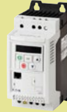
PowerXL™ DC1 Compact Machinery Drive