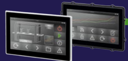
XV300 —HMI/PLC with multi-touch technology