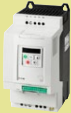
PowerXL™ DL1 Elevator Drive

The PowerXL™ DL1, also known as the elevator version of the PowerXL™ DA1, is designed for use with motors with up to 100 poles and PM motors. It's designed with specific functions for elevators that make it easy to integrate it into new elevator systems and retrofit it into existing ones.