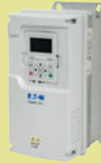
PowerXL™ DG1 General Purpose Drive

PowerXL™ DG1 general-purpose drives are variable frequency drives in Eaton's „Next-Generation“ PowerXL™ series. They are specifically designed for modern, sophisticated applications: In fact, energy-saving algorithms, high short-circuit values, and a heavy-duty design all enable them to provide maximum efficiency, safety, and reliability.