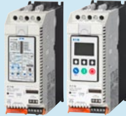
S801+ / S811+