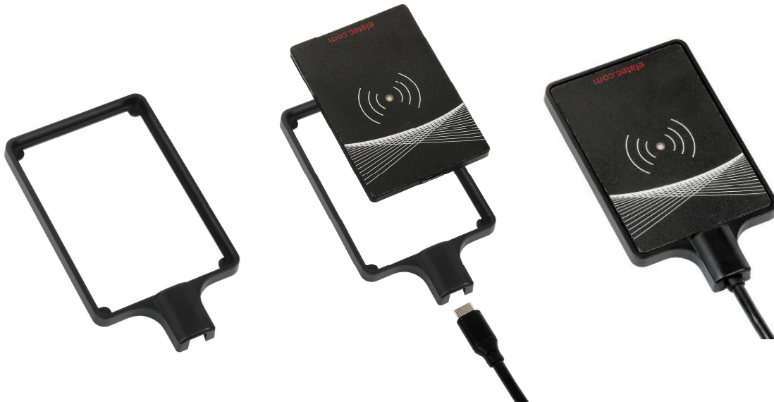
TWN4 Slim Mounting Frame Front View