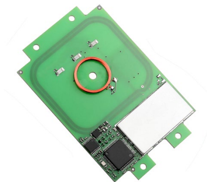
TWN4 MultiTech 2 LEGIC M LF HF PCB top view (exemplary)