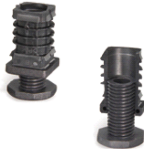
NDA.Q-20 + NDA.Q-25