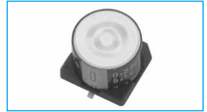
Marking color : White print on an brown sleeve