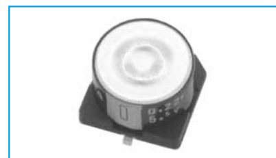
Marking color : White print on an brown sleeve