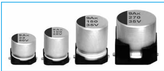
Marking color : Blue print