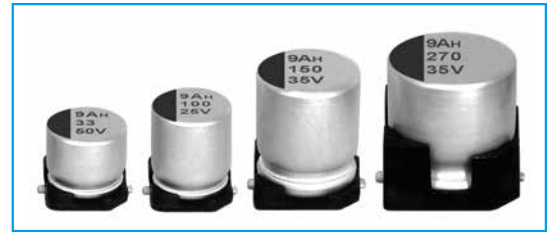
Marking color : Blue print