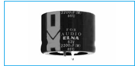
Marking color : Gold print on a black sleeve