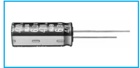
Marking color : White print on a black sleeve White print on a brown sleeve