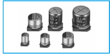
Marking color : Black print ( \phi 4 \times 5.3L - \phi 8 \times 6.5L, \phi 12.5 \times 13.5L ) : White print on a brown sleeve ( \phi 8 \times 10L - \phi 10 \times 10.5L )