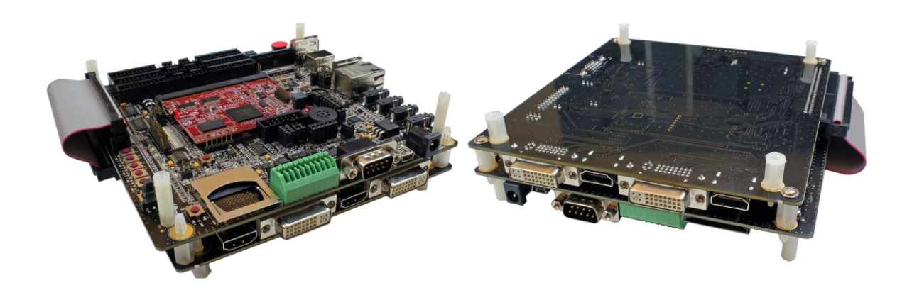
Figure 1 - Display Expansion Board and OEM Base Board Mounting