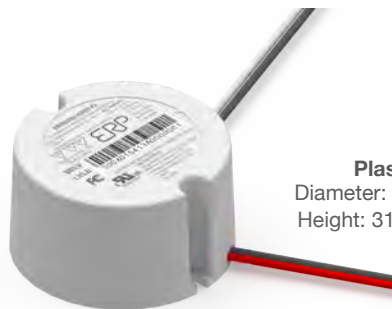
Plastic Case Diameter: 58 mm (2.28 in) Height: 31.7 mm (1.25 in)