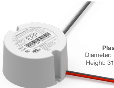
Plastic Case Diameter: 58 mm (2.28 in) Height: 31.7 mm (1.25 in)