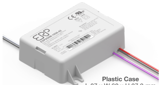
Plastic Case L 87 x W 60 x H 27.2 mm (L 3.43 x W 2.36 x H 1.07 in)