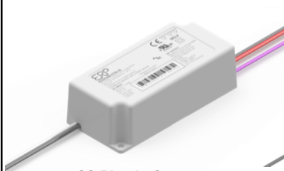
ESS Plastic Case L 84 x W 40 x H 25 mm (L 3.30 x W 1.57 x H 0.99 in)