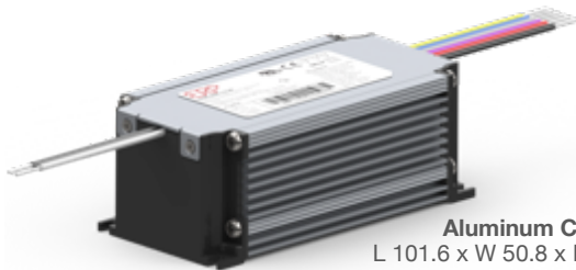
Aluminum Case L 101.6 x W 50.8 x H 38.5 mm (L 4 x W 2 x H 1.52 in)