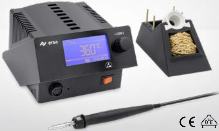
i-CON 1 MK2 with i-TOOL MK2