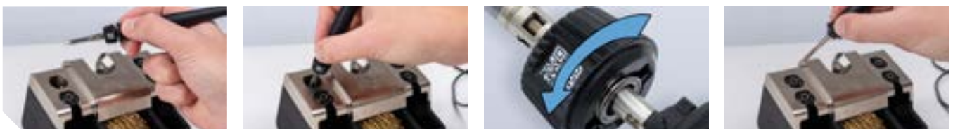
Super fast tip change: by hand or using the 0A58 tool holder which is compatible with i-TOOL TRACE and all i-TOOL MK2 series soldering irons (option).