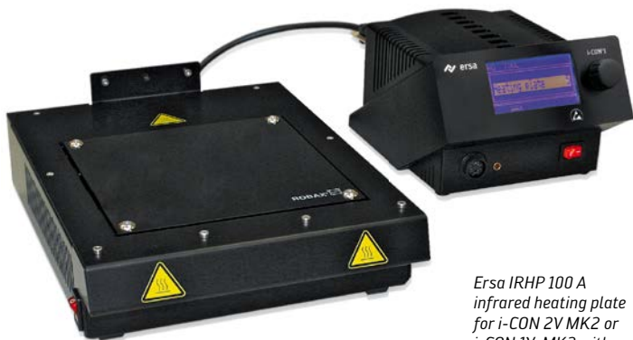
ErsalRHP 100 A infrared heating plate for i-CON 2V MK2 or i-CON 1V MK2 with interface.