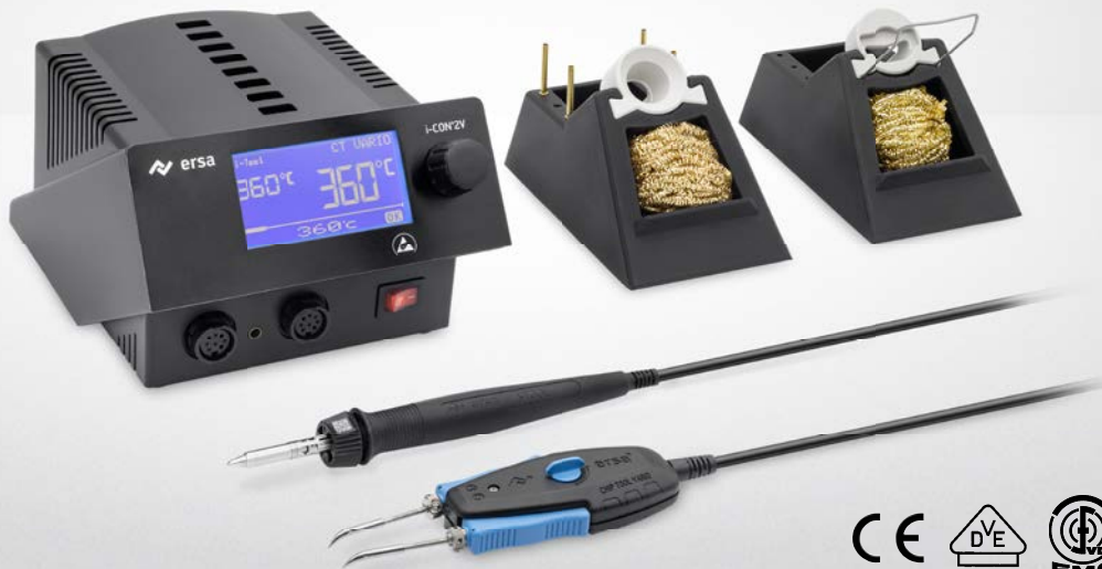
i-CON 2V MK2 with i-TOOL MK2 & CHIP TOOL VARIO