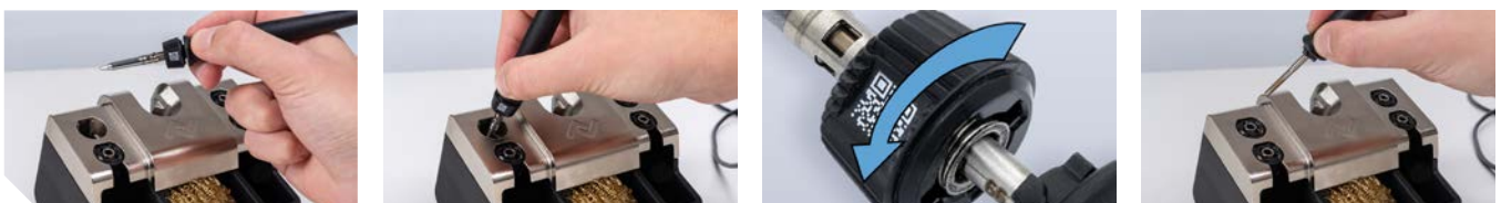
Super fast tip change: by hand or using the 0A58 tool holder which is compatible with i-TOOL TRACE and all i-TOOL MK2 series soldering irons (option).