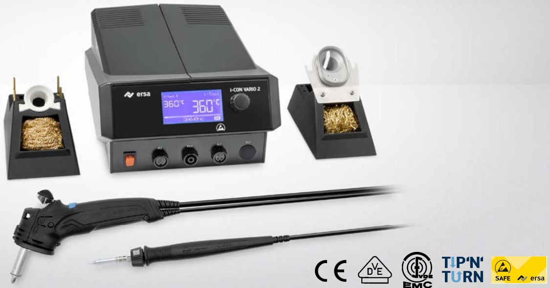
i-CON VARIO 2 MK2 with i-TOOL MK2 and X-TOOL VARIO