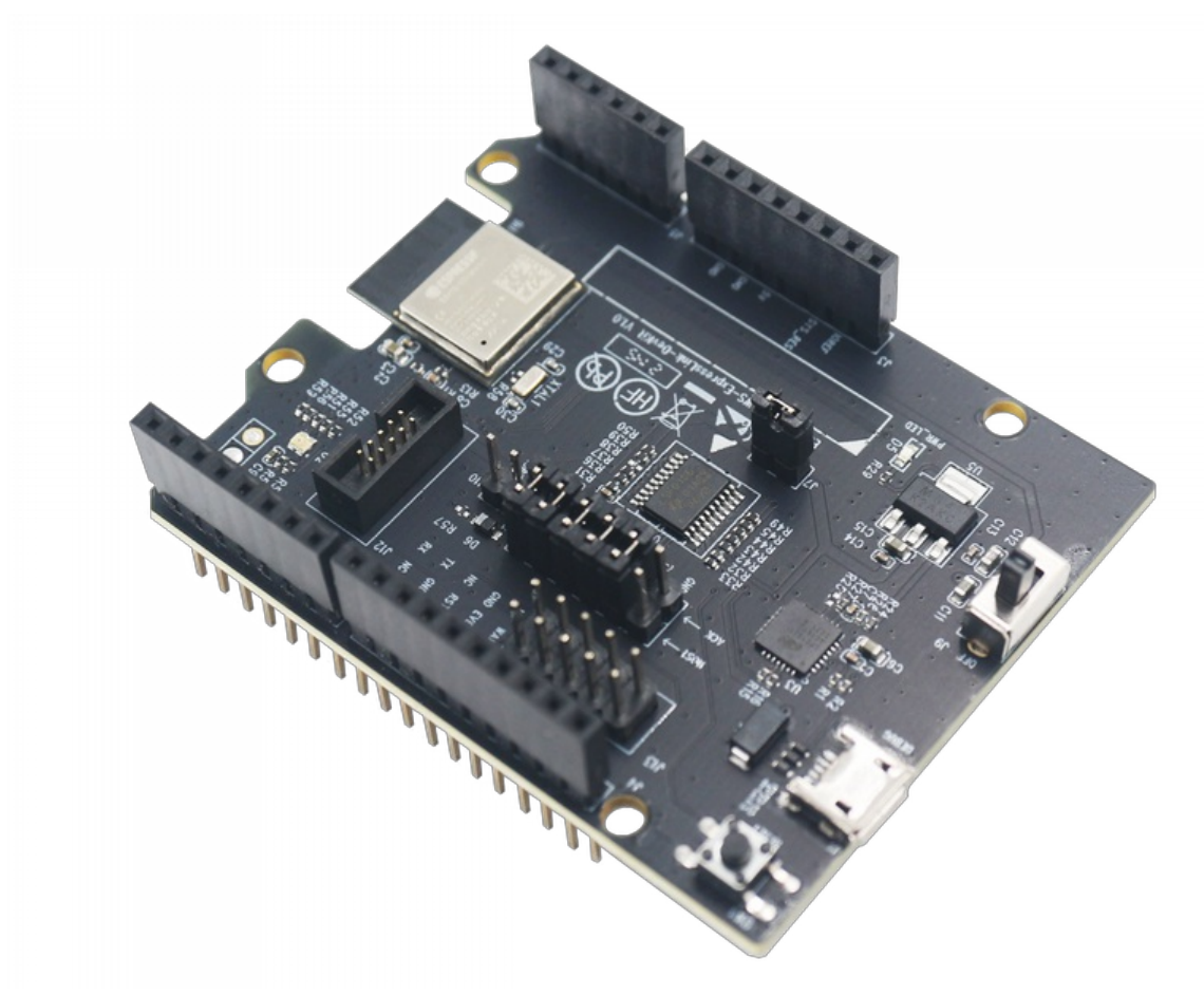
ESP32-C3-AWS-ExpressLink-DevKit with ESP32-C3-MINI-1 module

This user guide will help you get started with ESP32-C3-AWS-ExpressLink-DevKit and will also provide more in-depth information.