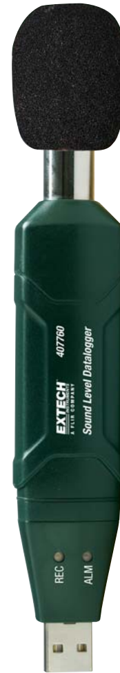
USB connector plugs into PC for quick downloading of Sound Level data to be analyzed using the software included