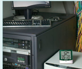
Alerts low Humidity levels in Computer rooms to help prevent electrostatic conditions.