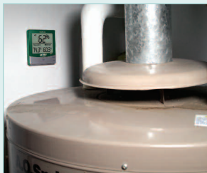
Monitoring Dew Point levels in a Basement for potential mold growth.