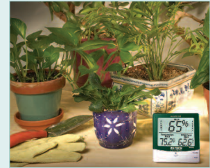
Checks the Humidity and Temperature levels for optimal plant growth in greenhouses.