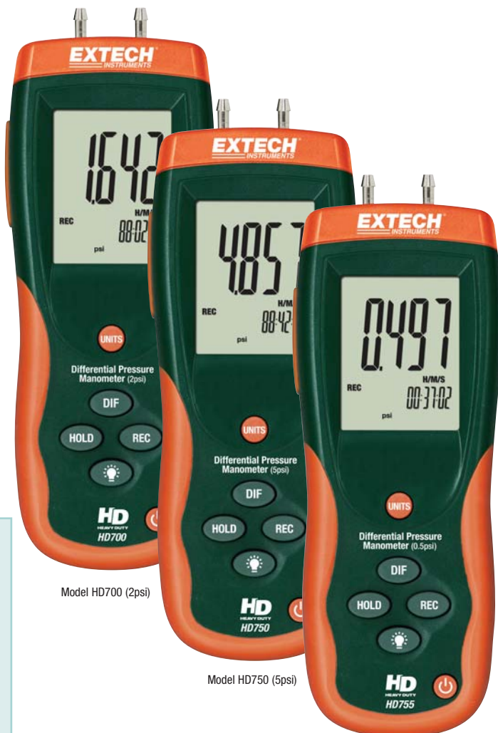
Model HD700 (2psi)