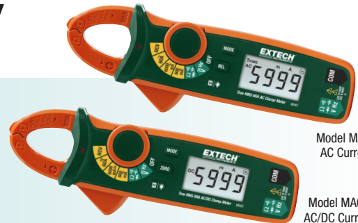
Model MA61 AC Current