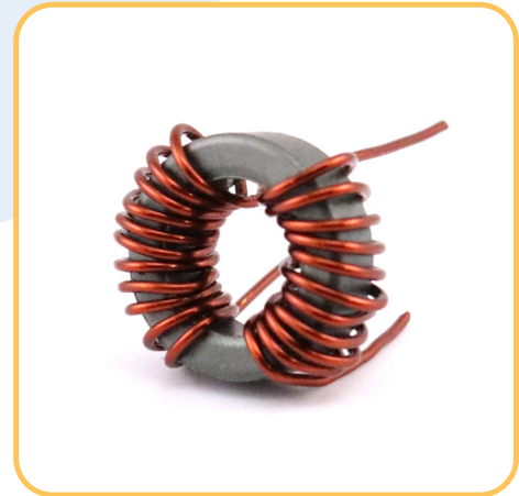
Part comes as a bare core. Sector wound shown.