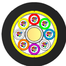
8 Elements Cable