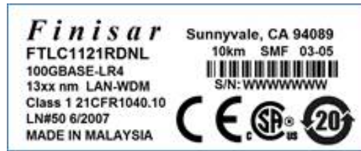
Figure 2. Standard Product Label