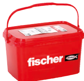
S in bucket