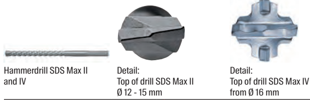
Hammerdrill SDS Max II and IV