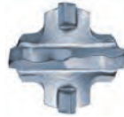
Detail: Top of drill SDS Max IV from Ø 16 mm