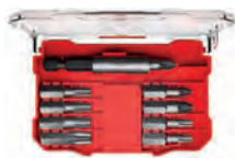
BitSet FPB Profi W10