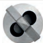
Detail: Top of drill FHD Ø 12 - 14 mm