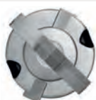
Detail: Top of drill FHD Ø 16 - 18 mm Top of drill FHD Max Ø 16 - 35 mm