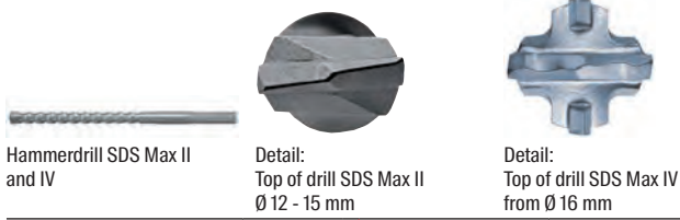
Hammerdrill SDS Max II and IV