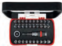
BitSet FPB Profi W32