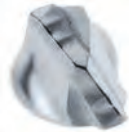
Detail: top of drill SDS Plus II Pointer