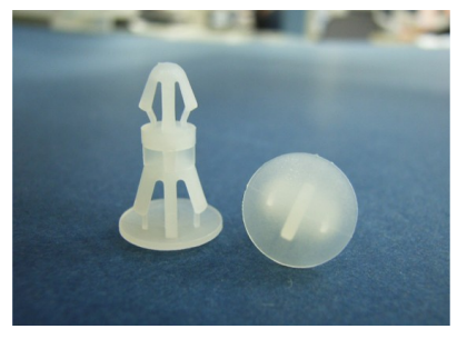
MATERIAL: NYLON 66(UL) FLAME CLASS: 94V-2 COLOR:NATURAL