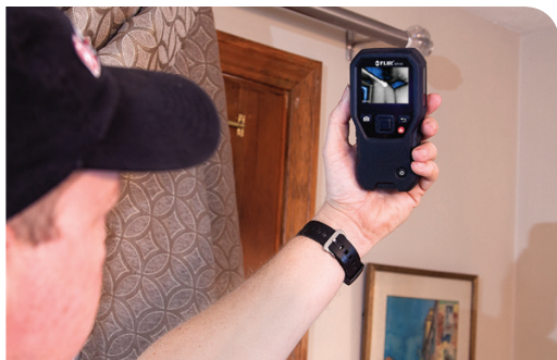
Scanning ceiling & wall joint for moisture issues